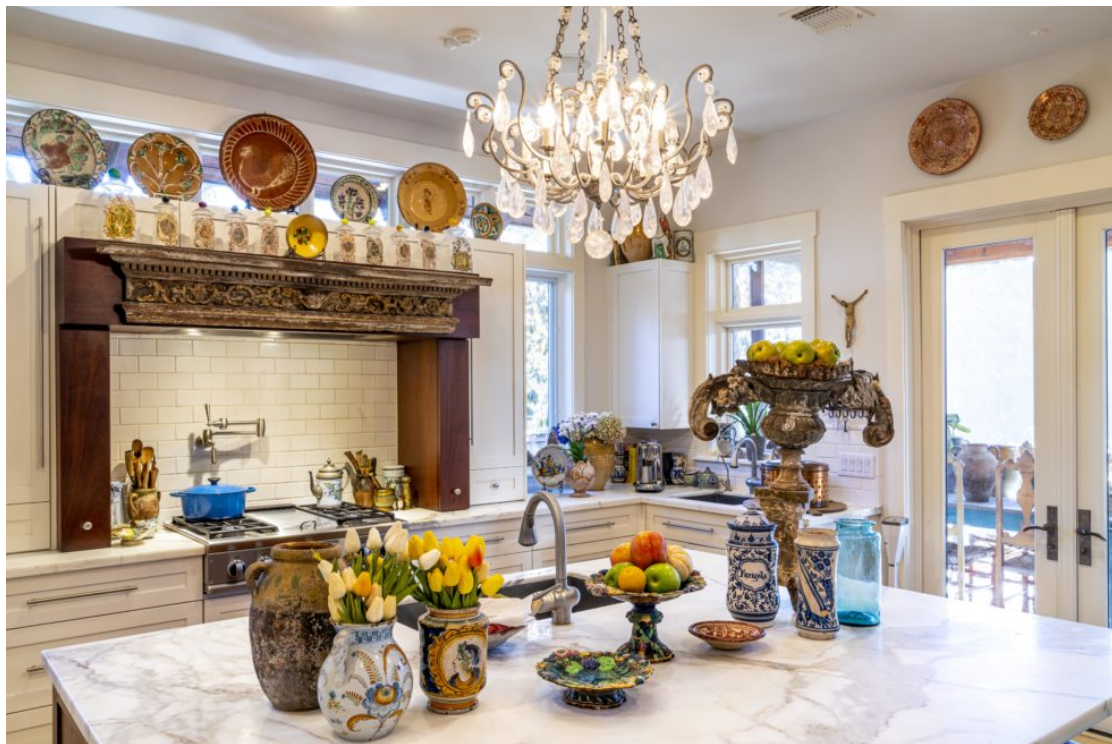
AT HOME: A modern sense of the old world